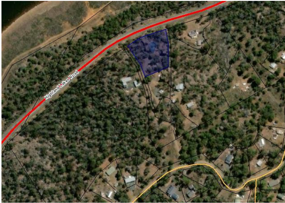
Map 2_ Ariel Photograph. The site boundary is highlighted in blue. Source: The List 04/07/2023