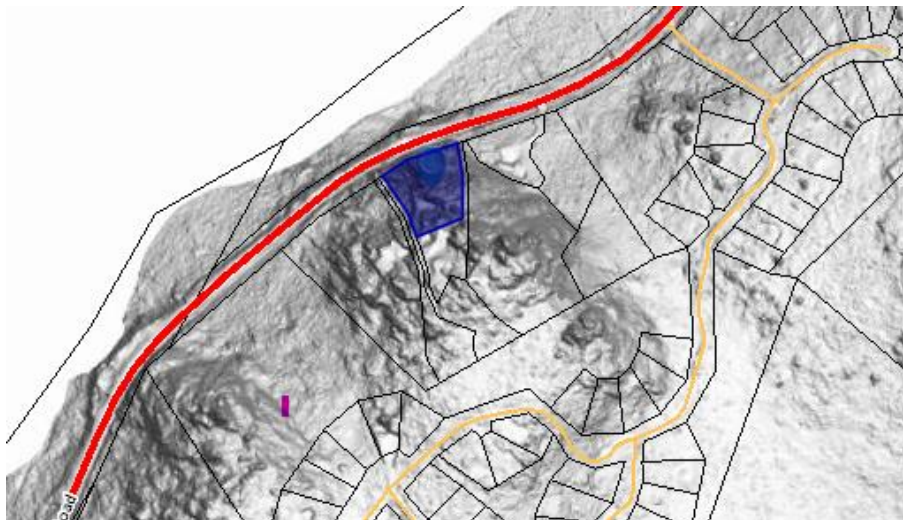
Map 3_ Hillshade Ariel Photograph. The site boundary is highlighted in blue. Darker grey areas on the image represent higher elevations (hills).