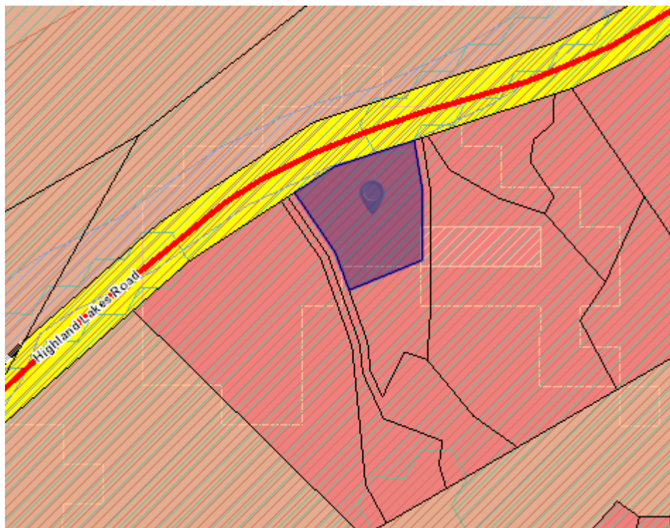
Map 1_ The site is in the Low Density Residential Zone, as shown by the red colour on the map. The site boundary is highlighted in blue. Green lines represent areas of Priority Vegetation Overlay and orange lines indicate the Low landslide Hazard Areas.

The land rises from Jones Road, up to the top of the ridge, the proposed Visitor Accommodation is down slope of the ridge, adjacent to Highland Lakes Road.