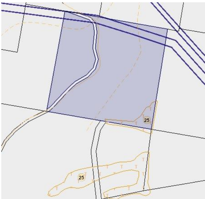
Fig 4. Threatened Native Vegetation Community (TNVC 2020), site area is shown in blue