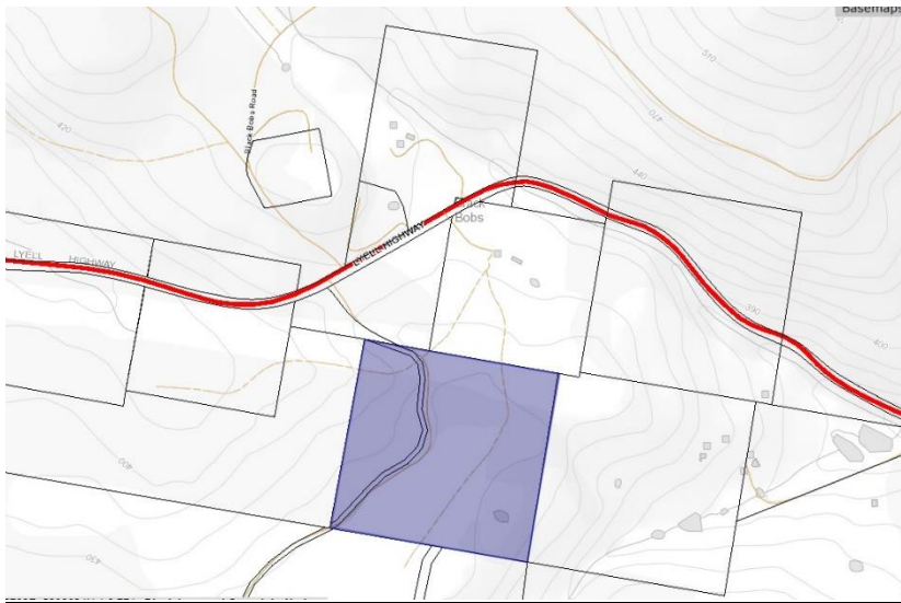
Fig 3. Topography of the site in the context of the nearby surrounding landscape, site area is shown in blue