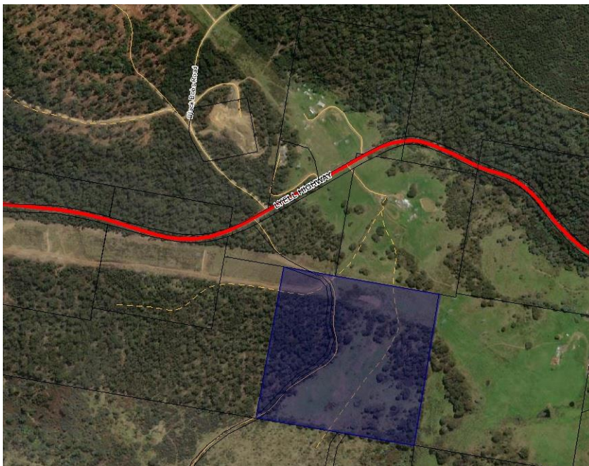
Fig 2. Aerial photo of the subject land and surrounding area, site area is shown in blue.