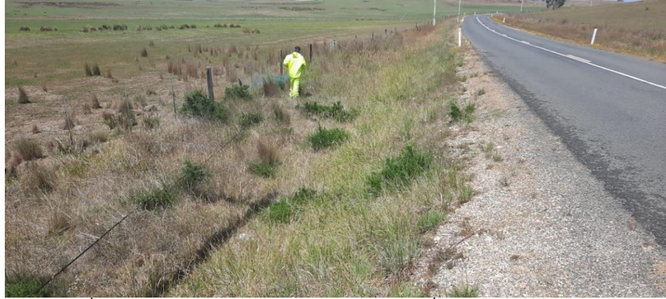
Hollow Tree Road weed management

The season has remained to be a challenging one to predict but the ground crew have been out on the roads treating weeds. A focus this season has been to treat weeds along Hollow Tree Road. As you would know, the road is a complicated place to work safely along and as such we waited until extra traffic management could be used. The ground crew have since been back to treat any remaining weeds along safer sections of the road, and we look forward to seeing how it progresses.