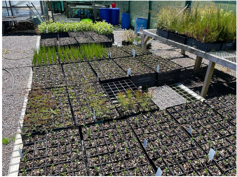
New plant growth at the Hamilton nursery

The summer months have brought on growth at the nursery, and we are already running out of space. Karen the Nursery Manager is busily pricking out and growing plants for internal and external planting projects scheduled for autumn.