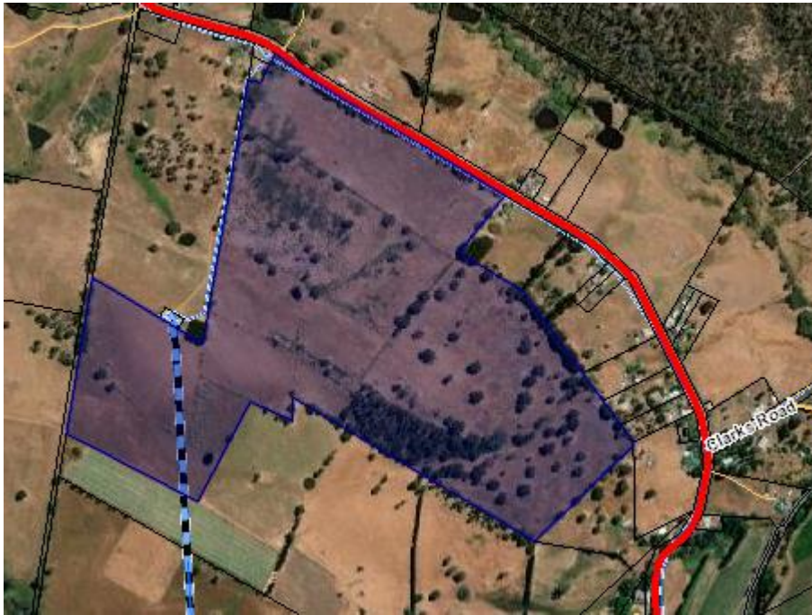
Map 2_Aerial image of the subject land and surrounding area. Subject titles marked with blue line. TasWater infrastructure is shown as blue and black line. Source: LISTmap (02/01/24)