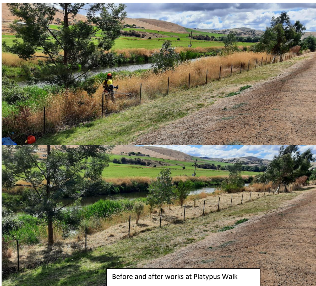
Before and after works at Platypus Walk