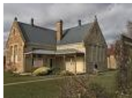
The Grange, Ph: 6259 5556

Castle Hotel, Ph: 6259 5502 Bothwell Bakery, Ph: 6259 5611 Bothwell Super Store, Ph: 6259 5508 Bothwell Garage, Ph: 6259 5599