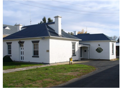
Picture of Bothwell Office