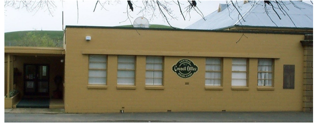
Picture of Hamilton Office